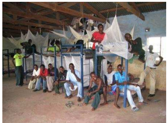
... and after

In an attempt to improve the living conditions Chipembele raised money from a number of donors and arranged for 26 strong metal bunk beds to be made by a local welder. Since this picture was taken the funds have also allowed for the dormitory walls to be painted and it all looks so much fresher and brighter. The boys are exceedingly happy and morale has soared.