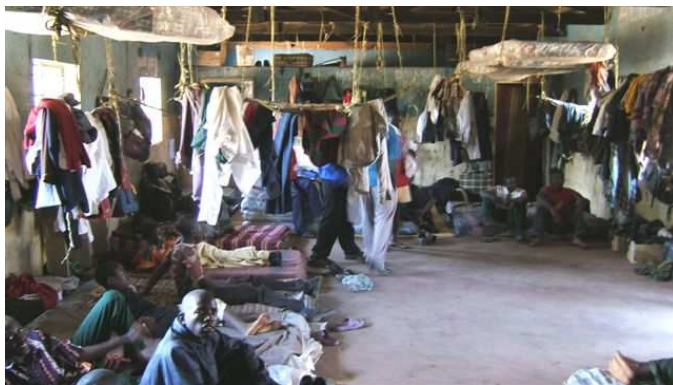
Sleeping arrangements before....

The boys' dormitory at Mfuwe Secondary School greatly shocked every new visitor that entered the door... 80 boys crammed into a shell of an old building, no glass in the windows, no furniture for their clothes or belongings, even no beds. They have no toilets and no washing facilities apart from drawing water from a nearby communal well and then 'bathing' behind some bushes. They sleep 2 to a single mattress and put up with these cramped and unhygienic conditions, just for a chance to be in school.