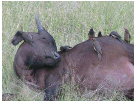
Elton in ecstasy with buffalo weaver birds removing his ticks